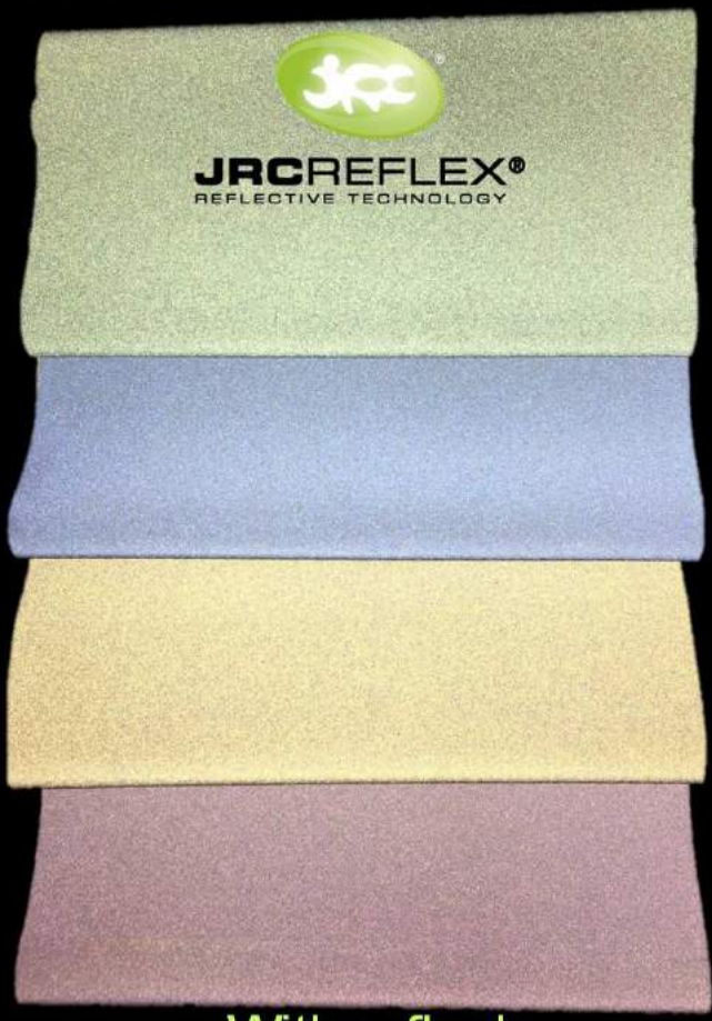
With a flash