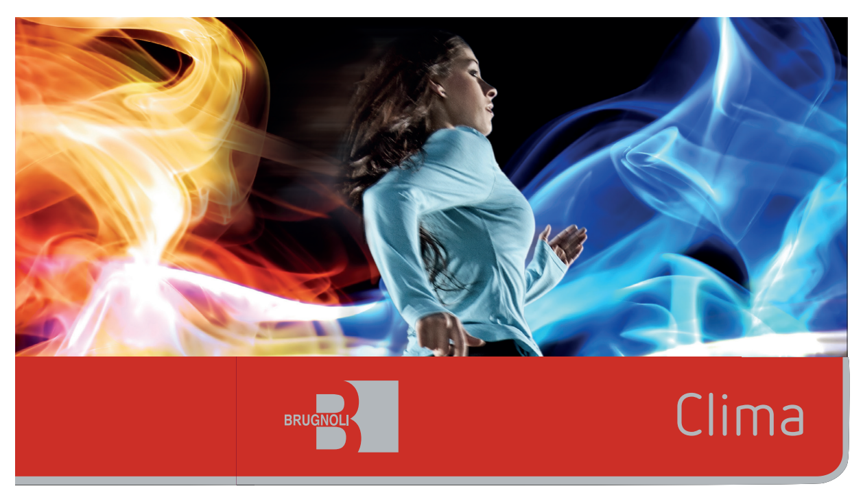
Performance Days 2016 - Munich, 20th-21st April 2016