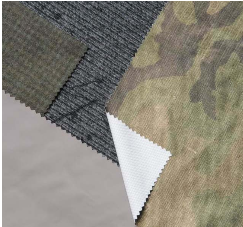
clockwise: Frati, Dyntex, SianTex, Aiale