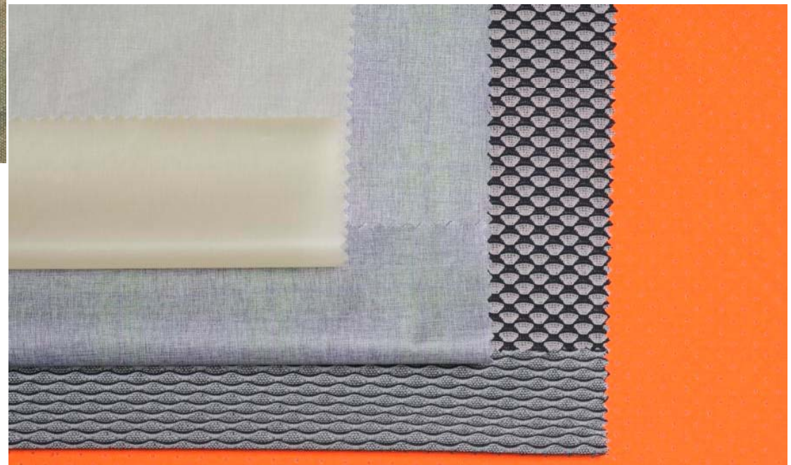
from left: Solis, Wide Plus, MITI, Achievetex