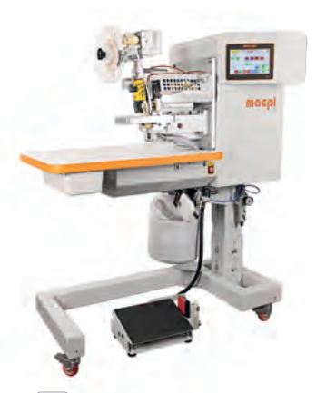
337.32 Glue laydown