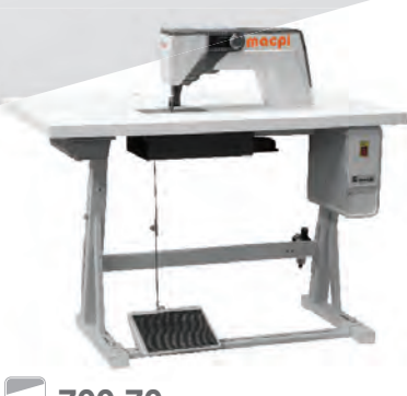
700.70 Ultrasonic machine