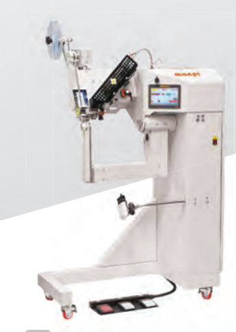
336.61 Seam sealing machine