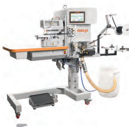
337.02 NR Edge binding