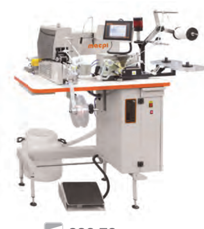
338.78 Bra strap bonding