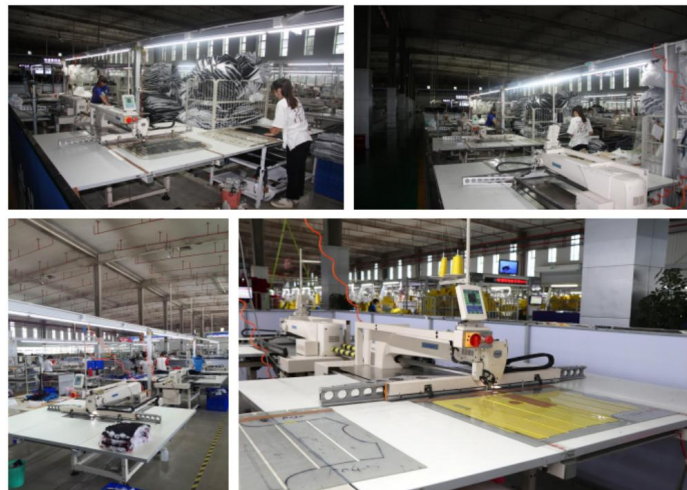
服装部 智能数控电脑车 Garment intelligent CNC computer lathe