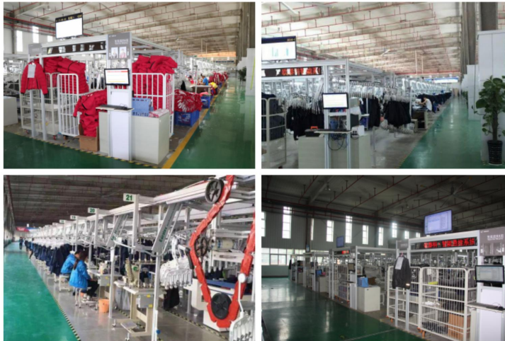
服装部 生产车间 Production workshop of clothing department