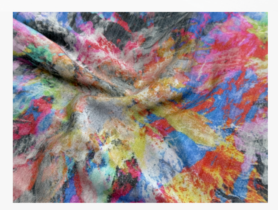
C02 emissions: 15.1230 kg Co2e/kg