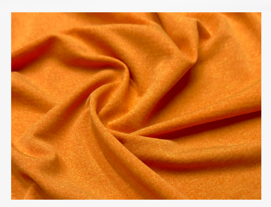
C02 emissions: 9.8309 kg Co2e/kg