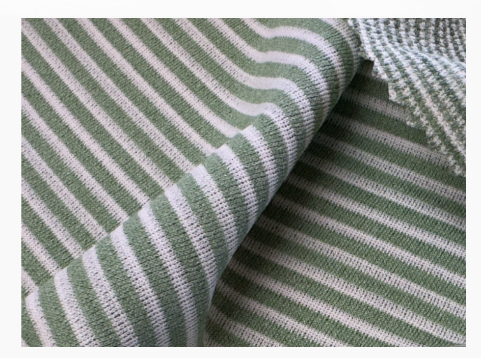
C02 emissions: 13.2482 kg Co2e/kg