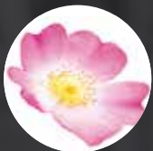
Rose Hip Oil