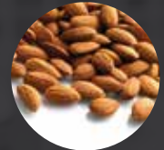
Sweet Almond Oil