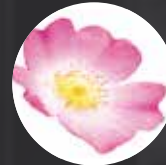
Rose Hip Oil

NOVAREL Fibers: The real cosmetotextiles